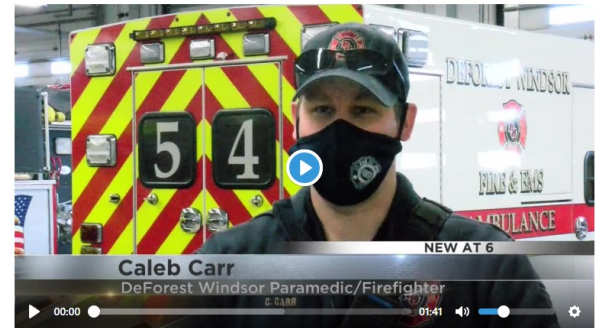
DeForest baby delivered in ambulance

Check out this news story about DeForest Windsor Fire/EMS from earlier this year!