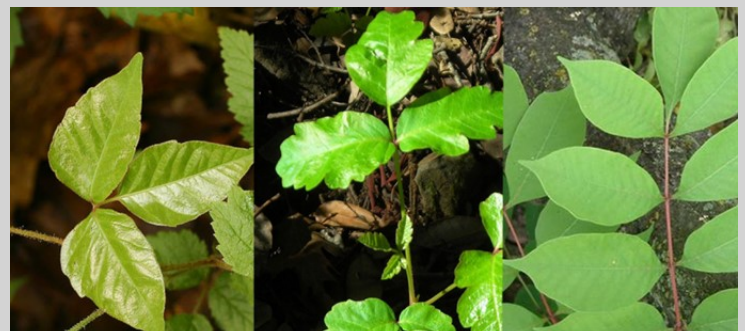
Poison ivy Poison oak Sumac